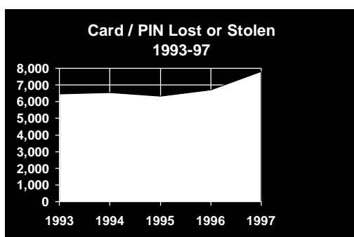
Figure 2. Number of Complaints where Card or PIN was lost or stolen, 1993-97, Australia

As we have seen, offenders may also alter cards or manufacture counterfeit cards. Occasionally, this may occur on a wide scale. In England, for example, an operation mounted by the Metropolitan Police Organised Crime Group led to the seizure of 100,000 forged, plastic cashpoint (ATM) and credit cards, as well as various computers and equipment used to insert information on magnetic strips (Anonymous 1996, p. 4).