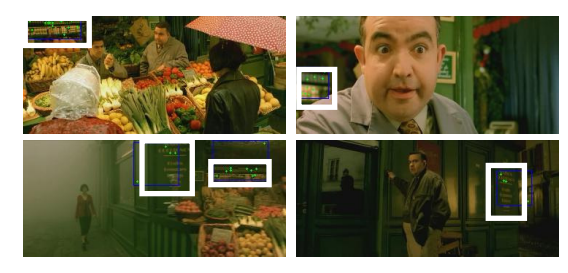
Figure 2. Links for "Amélie's kitchen" class (top), "bar" class (middle) and "grocery" class (bottom). Matches are in white boxes.

False links usually appear in common similar visual structure, like striated or squared structure. They are often composed of less than five visterms. Figure 3 shows examples of false links.