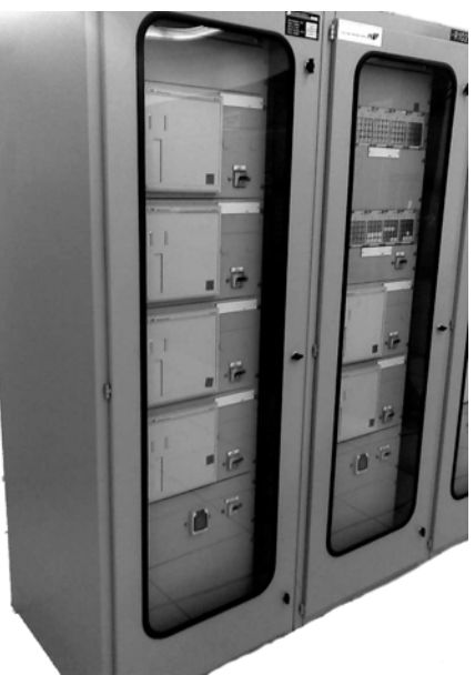
Fig. 2 – Method of MPD Installation into Cabinets in Use Today.

Historically, [5] there are a large number of non-interchangeable and incompatible MPD designs. This means that if a certain module of any MPD installed in the particular substation or power station fails, it can be replaced only by the same component, produced by the same manufacturer. Thus, after spending a small fortune purchasing an MPD from a specific manufacturer, one falls into economic dependence on this manufacturer for the next 10–15 years, since after having chosen one manufacturer it no longer makes any difference if there are other manufacturers in the market, as one cannot use their products. And the only way to get out of this is to pay a small fortune one more time for the MPD from another manufacturer (and, thus, switching from one bondage to another). And what does the manufacturer do with an absolute monopoly? Right: the manufacturer increases the price! The price of one spare MPD module can reach almost one-third or even a half of that of the entire MPD! As