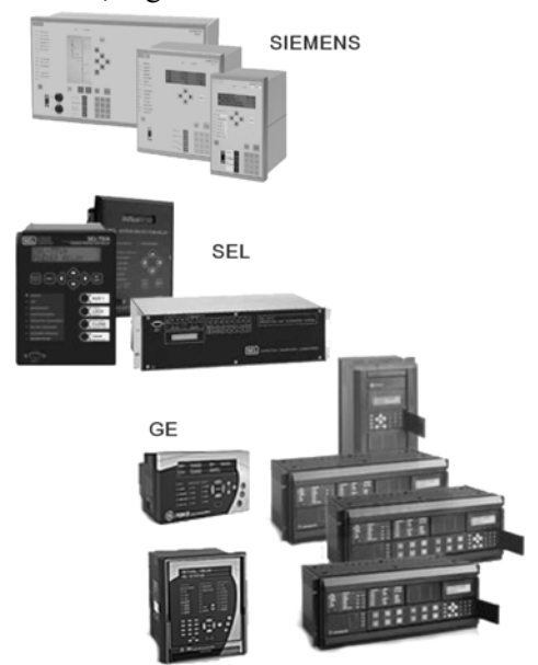
Fig. 1 – Configuration of Modern MPDs of Different Brands.

Usually separate MPDs are installed in relay cabinets: 3 - 5 units in each cabinet, Fig. 2.