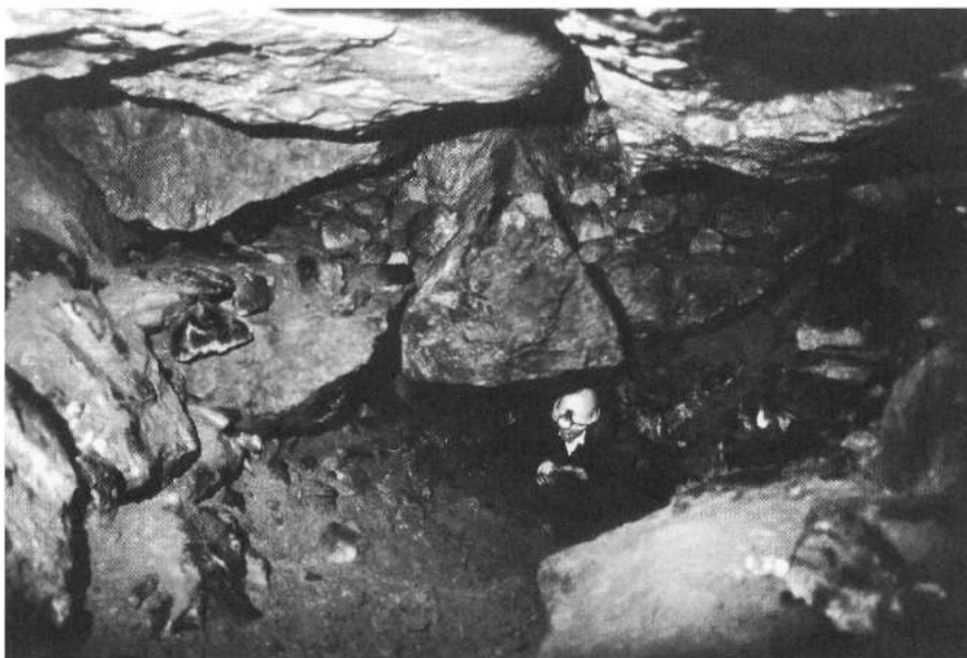
Team member at work in Kestel Mine

near the mine as well as on Göltepe hill. One such crucible was analyzed at the Conservation Analytical Laboratory of the Smithsonian Institution in 1992 and found to have a tin-rich interior surface, similar to the ones found at Göltepe. It is possible that the crucibles at Kestel could have been used to assay the ore for tin content in order to make strategic decisions during mining.