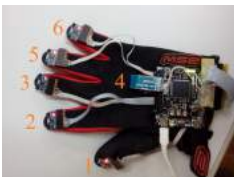
Fig. 2. Prototype of the gesture capture glove with the indication of the location of the six MPU 6050 sensors.