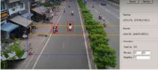
Fig. 4. Counting the motorbikes and cars differently that are in the range between the two yellow lines.