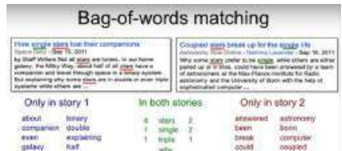
Fig. 2. Determining weight for specified words.