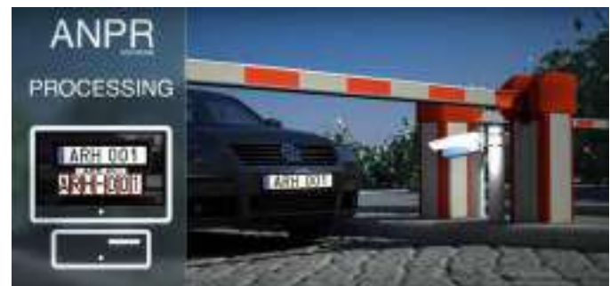
Fig. 3. Capturing car plate and translate to digital text.